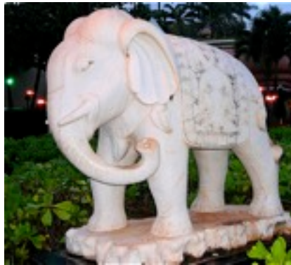
White elephant