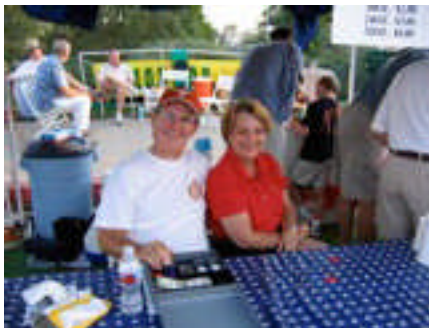
Above: A few of the Rotarians and friends present at the July 4 Rotary booth.