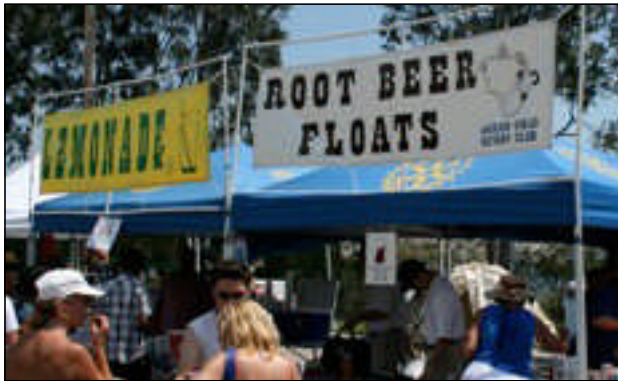
Left: The 4th of July Booth in which the Rotary Club made traditional root beer floats and sold lemonade - big hits on a very warm day!

Another wonderful 4th of July gala celebrating our independence and honoring the men and women that have given, and are giving, so much for our continued freedoms.