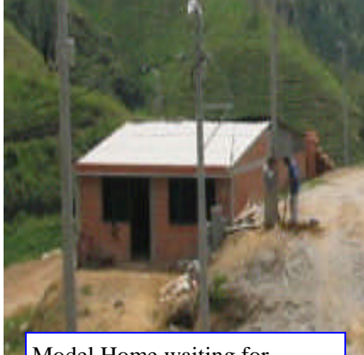
Model Home waiting for Approval from Colombian Government and funds to cover 70% of costs for the 30 homes to be built