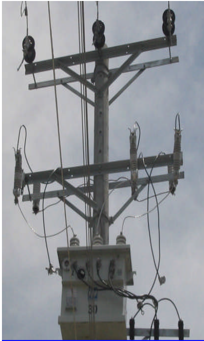
Transformer has been installed. This will supply electricity to all 30 Homes.