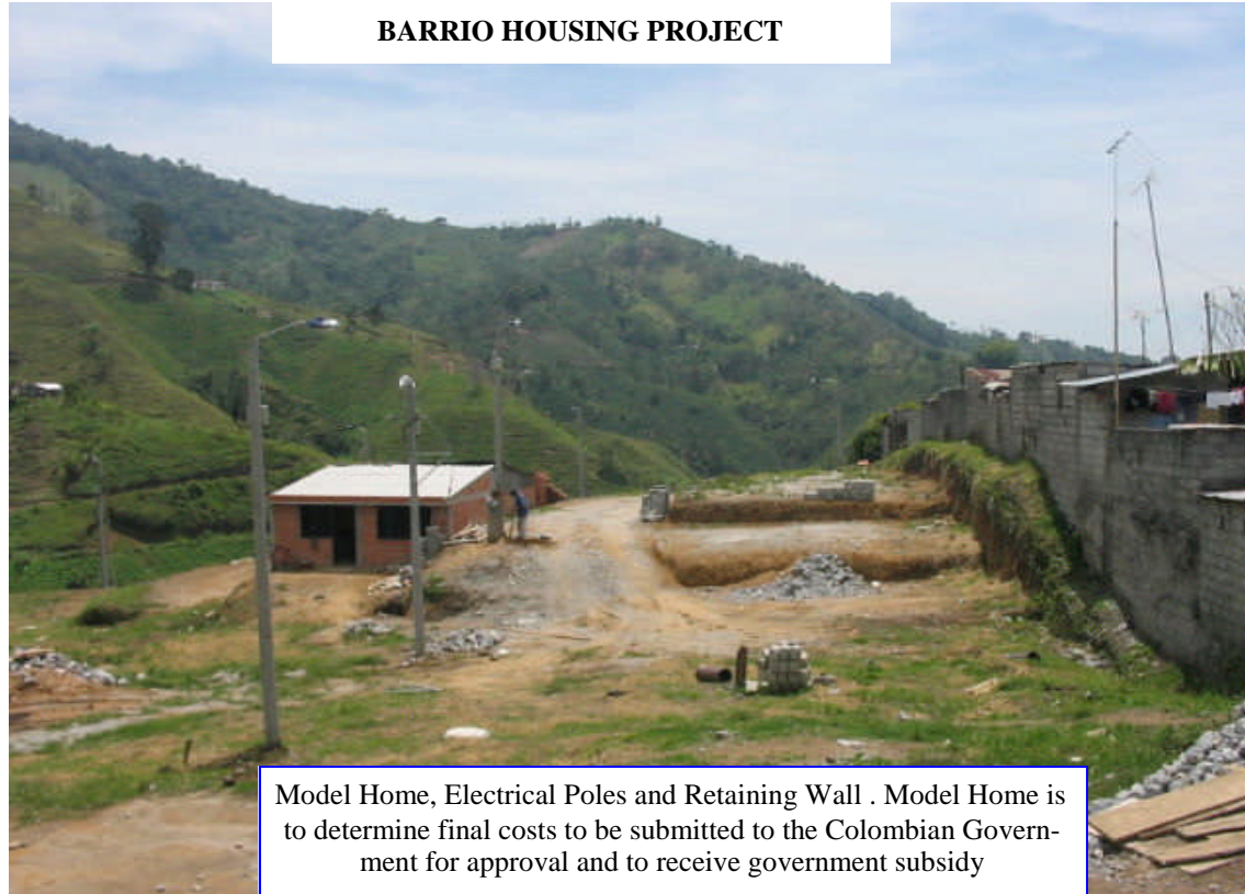
Model Home, Electrical Poles and Retaining Wall . Model Home is to determine final costs to be submitted to the Colombian Government for approval and to receive government subsidy