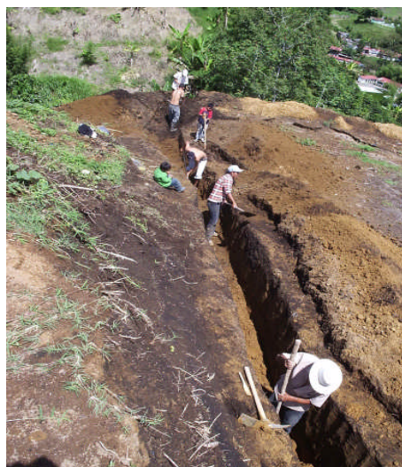
Putting In The Sewer Lines