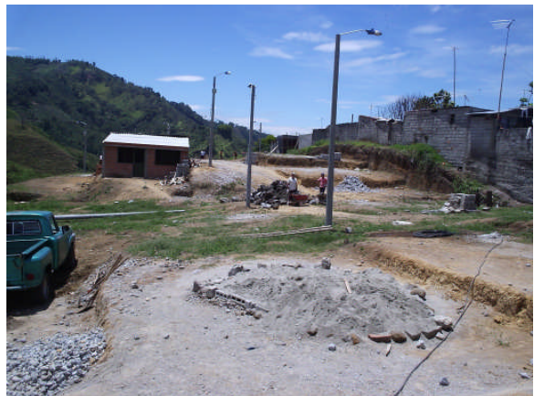
The Electric Light Posts Are Now In Place