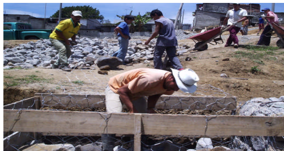
Building Retaining Wall With Manual Labor