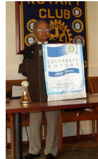
"They Could Hear the birds sing again"