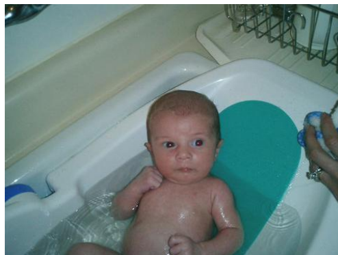
HI GRANDPA!! Hi Grandma!!