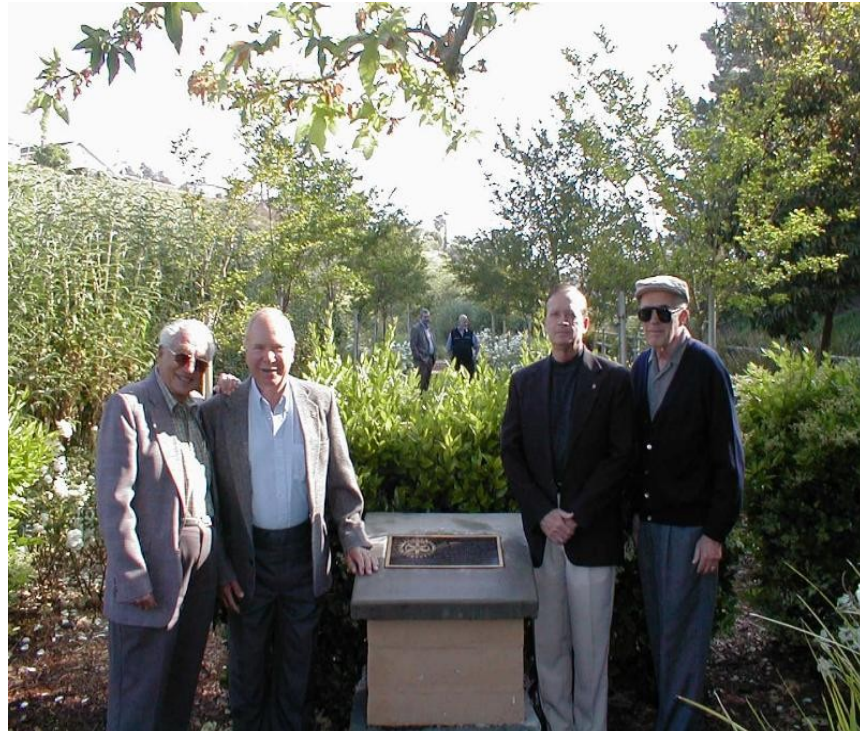
Aliso Creek Trail, Mission Viejo, California

A Special Memorial Program is held Tuesday annually for all the deceased Rotarians of the Rotary Club of Mission Viejo. This year we held the Memorial Services on Tuesday April 26th. Shown above is Rotarians gathered around the special plaque at our Memorial Garden located on the Aliso Creek Trail.