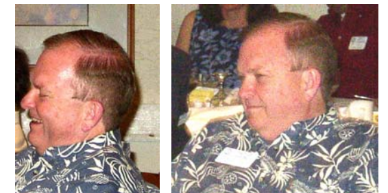
Good News Smile! "I don't know about that!"