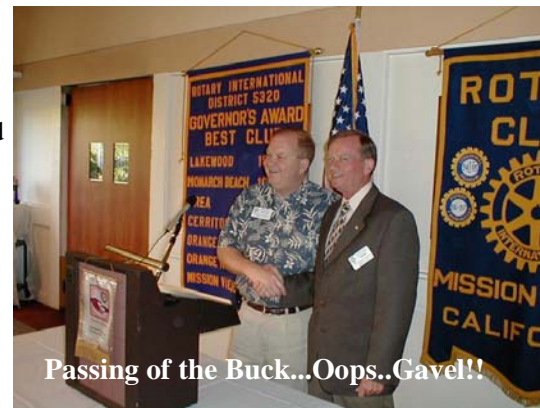
Passing of the Buck...Oops..Gavel!!