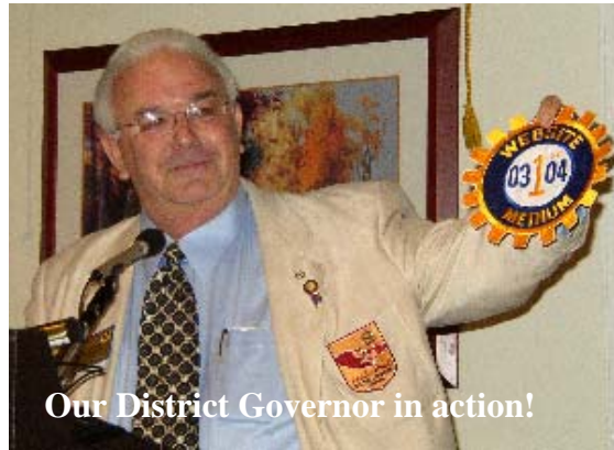
Our District Governor in action!

CONGRATULATIONS CLUB MEMBERS FOR OUTSTANDING PERFORMANCES!