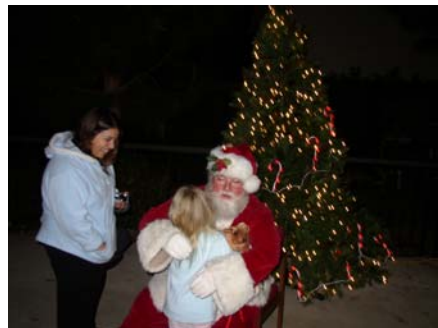
Santa? You bet!