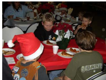
Good Food? You bet!