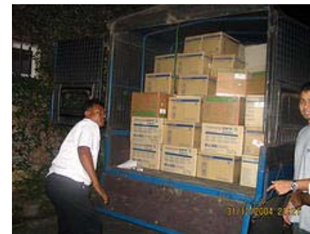
Photo on the left shows medical supplies lorri from Regency Colombo Rotary Club.