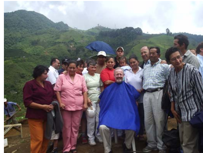
Photo With the families who are working to receive a home which will give them a safer, cleaner and more secure place to live.