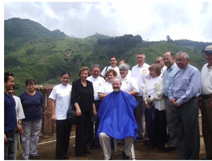
Freshly cut with members of The Rotary Club of Libano