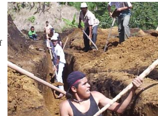
GROUND BROKEN ON OUR HOUSING PROJECT IN SOUTH AMERICA