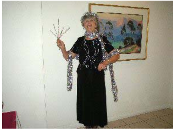
The Glitter Queen