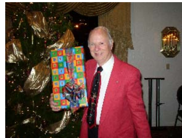
Tie Contest Winner