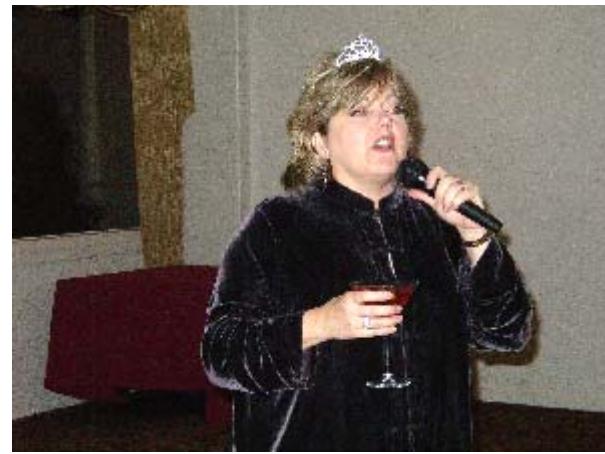
The Ceremonial Queen