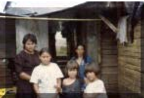
A Barrio Family