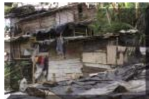
High Risk Area