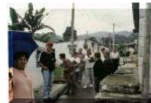
Rotarians and family helping to rebuild