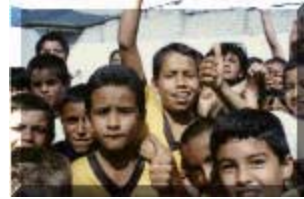
The Barrio Children